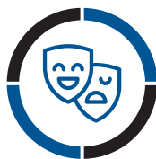
CEO / Wire Fraud